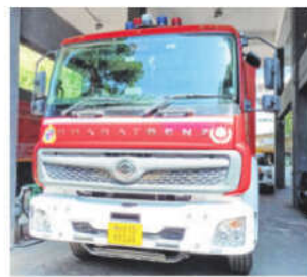
As per the National Building Code, buildings over 15m tall are classified as high-rises; Development Control Rules set the threshold at 24m

Fire officials said that in incidents of fires in high-rises, connecting multiple pumps in sequence to deliver water is time-consuming and physically demanding, with each pump weighing up to 125kg. This challenge intensifies for fires blazing at a height of 150m or above. The special vehicle acquired two years ago has proven effective for such blazes. Their pumps can provide a continuous water supply up to 240m, while their arms can extend horizontally up to 55m. It enables this vehicle to address fires in congested areas with narrow streets and to reach over other structures. It also features a water tank with a capacity exceeding 10,000 litres.