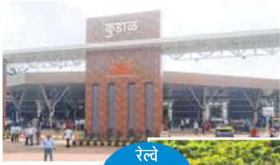
सोहळा मोठ्या थाटात पार पडला.

सिंधुदुर्ग जिल्हा हा कोल्हापूरला, पर्यायाने पश्चिम महाराष्ट्राला जोडला गेल्याने मालाची ने-आण करण्यासाठी त्याचा उपयोग होईलच शिवाय पर्यटन वाढीसाठी त्याचा उपयोग होईल, असे राणे यांनी सांगितले. कुडाळ रेल्वे स्थानकाच्या सुशोभीकरणाला लोकार्पण सोहळा राणे यांच्या हस्ते पार पडला, त्यावेळी ते बोलत होते. कोकणातील १२ रेल्वे स्थानकांचे सुशोभीकरण करण्याचा निर्णय घेण्यात आला असून गेल्या महिन्यात कणकवली, सावंतवाडी, सिंधुदुर्ग स्थानकांचा लोकार्पण सोहळा पार पडला. तर बुधवारी कुडाळ रेल्वे स्थानकाचा लोकार्पण